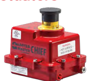
UL-508 LISTED UL-1203 ATEX Exd 11B T4