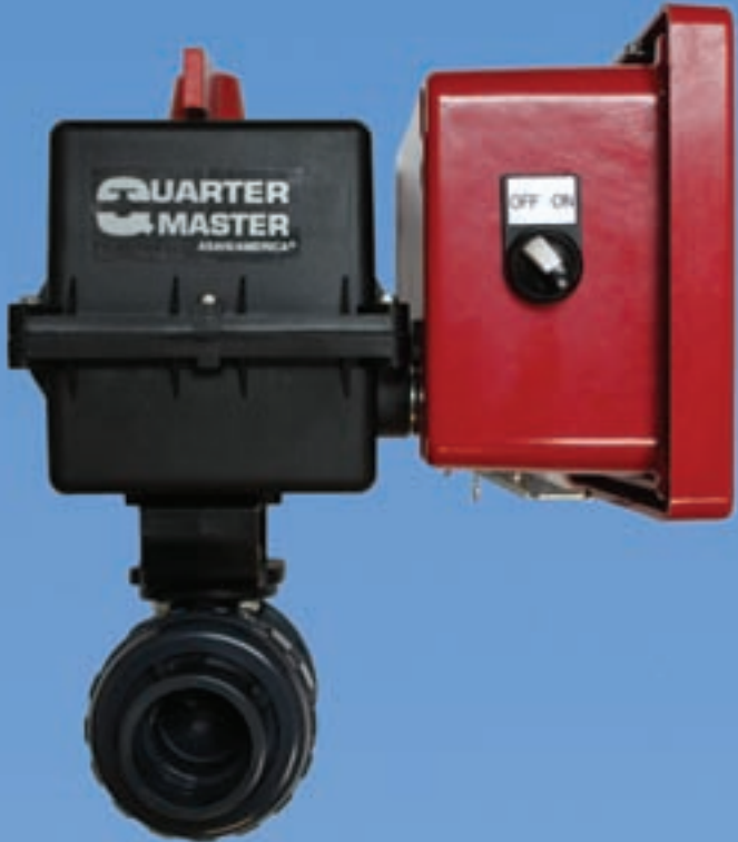
QM Remote Cycle™ w/ Series 94 Actuator & Type-21 Ball Valve