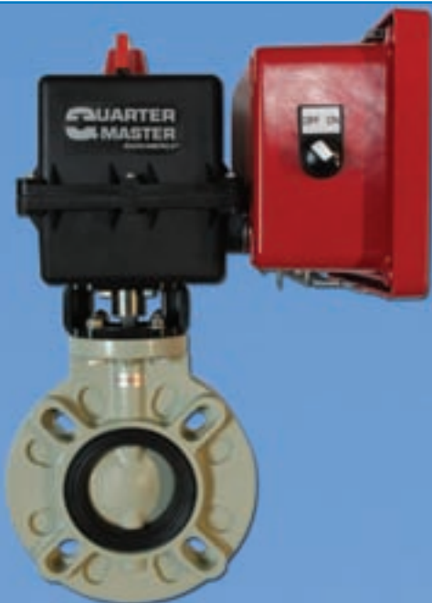
QM Remote Cycle™ w/ Series 94 Actuator & Type-57 Butterfly Valve