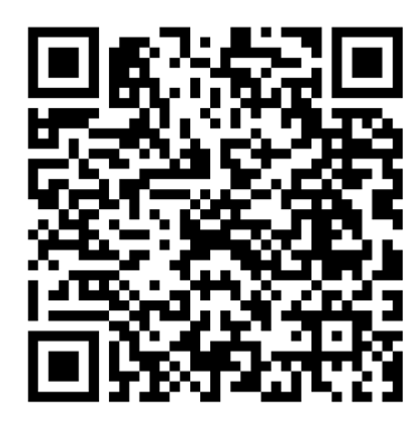
Download a copy of the full welding selection tool by scanning the QR code above!