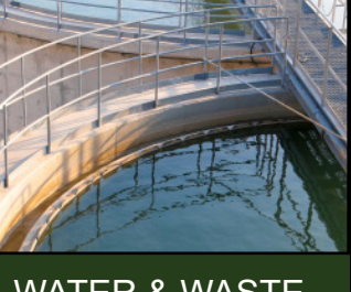
WATER & WASTE TREATMENT Chemical Feed Lines

Microelectronic Life-Science Industry Laboratories Waste Drain Pipe Chemical Process Piping