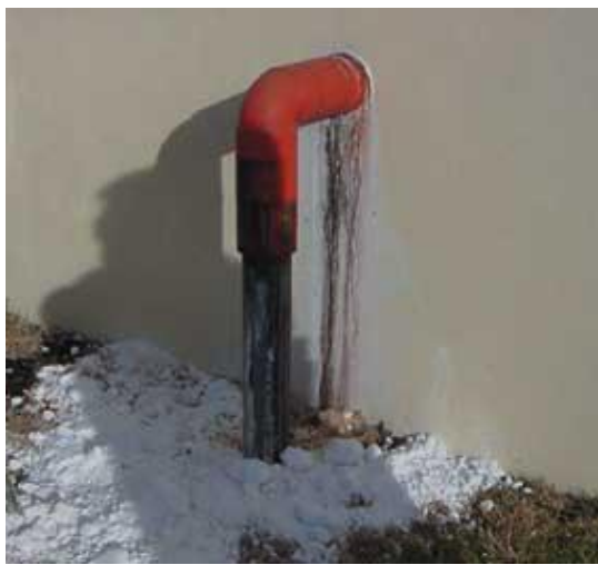
Figure 1: PVDF pipe failure due to the presence of sulfur trioxide.

In certain regions of the United States, 93 percent sulfuric acid has decreased in availability. However, the acid is readily available in 98 percent concentrations, as this concentration is a by-product of phosphate production. The reduction in availability of 93 percent acid, combined with the cost savings of using the more common 98 percent acid, caused many facilities to switch their acid supply from 93 to 98 percent. Many facilities running PVDF piping systems assumed that there would be no issue with using this acid in their pipelines.