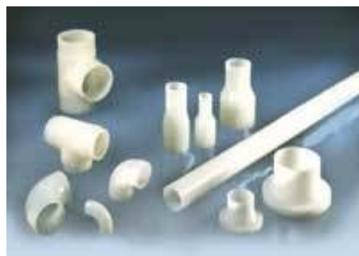
Asahi/America's Ultra Proline Piping System, made of Halar ® (E-CTFE), provides water and wastewater plants with superior protection against chemically induced system failure. The system is available in both single and double wall configurations.

Most plants specify 93 percent sulfuric acid for the treatment. A typical plant serving 140,000 people will use about 1,600 to 1,900 gallons of acid per day. The piping materials most commonly used to convey and inject the acid are carbon steel or polyvinylidene fluoride (PVDF). Carbon steel has many drawbacks, including maintenance requirements, which make it less attractive for plant owners. Therefore, PVDF thermoplastic piping, which features excellent chemical resistance to most acids, is widely used. It is generally available as a single-wall or double-contained piping system.