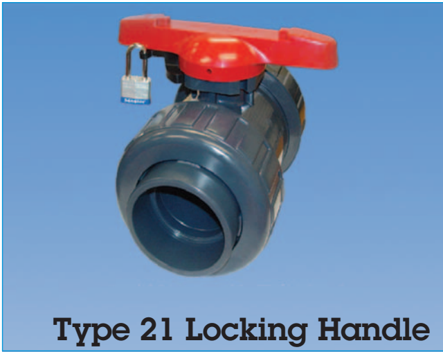
Type 21 Locking Handle