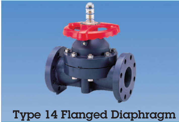
Type 14 Flanged Diaphragm