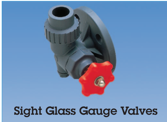
Sight Glass Gauge Valves