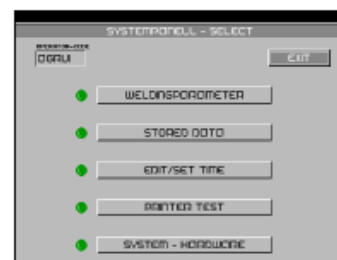
Data Storage and Hand Weld Parameter Selection