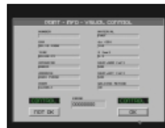
Final Review and Visual Check of Result