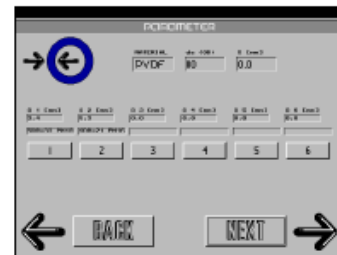
Pressure Rating/Wall Thickness Selection