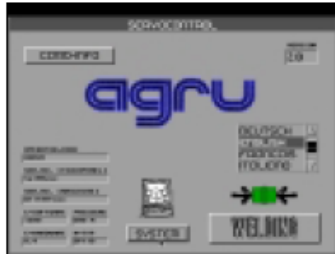
Start Up Screen and Language Selection