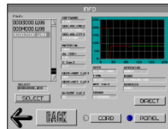
Internal Review of Weld by Serial Number