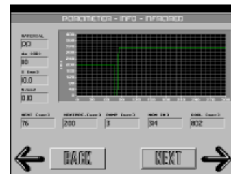
Graphic Display of Welding Parameters