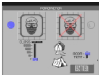
Welding Environment Entry