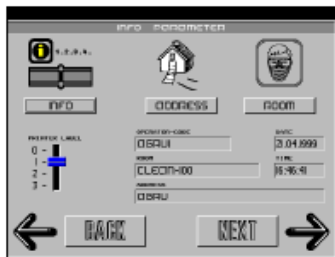
Label, Address and Room Selections