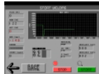
Graphic Tracking of Weld Process