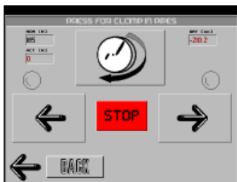
Planning of Material