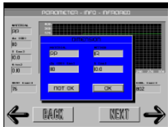
Verification of Material/Size Selection