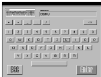
Address/Operator ID Entry