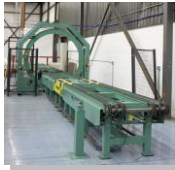
New Pipe Wrapping Machine

During last year's customer survey, you noted that you wanted improved packaging for our piping products. As a result, we purchased a new pipe packaging machine and improved our overall product packaging. You requested new product introductions to stimulate sales and we introduced our Type 571L butterfly valve, a new wafer check valve and an exciting new piping system, Chem Proline® PE 100-RC piping. You asked for new sales tools and we developed laminated product reference cards and cheat sheets.