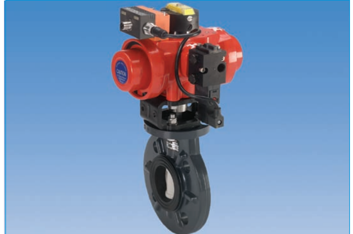
Series 79 Pneumatic Actuator and Butterfly Valve