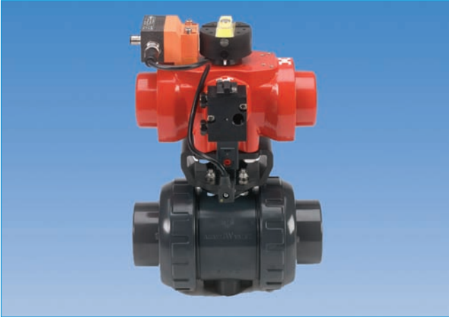
Series 79 Pneumatic Actuator and Ball Valve